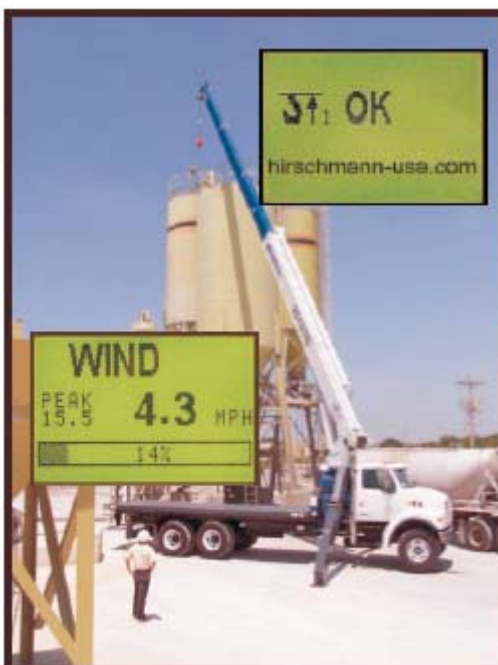
PRS 80 EZ A2B and wind speed displays