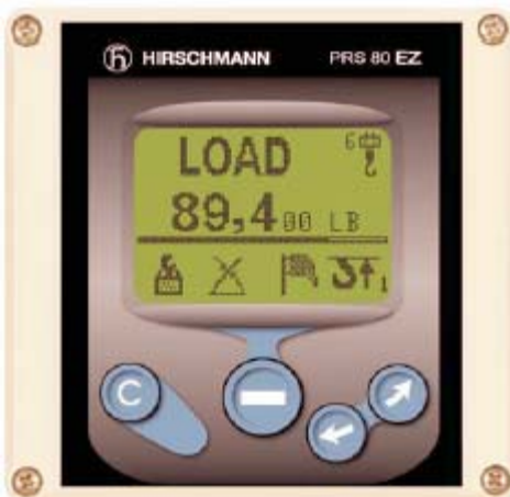
PRS 80 EZ Console and load display

The PRS 80 EZ's flexible design allows for monitoring single or multiple sensor inputs. The sensor inputs are displayed on a large back-lit graphic display which is capable of displaying up to seven sensors at one time. The PRS 80 EZ utilizes Frequency Hopping Spread Spectrum Technology (FHSS) which transmits on one of 25 different channels to ensure accurate and consistent reception of data. FHSS also provides additional protection against interference common to construction job sites.