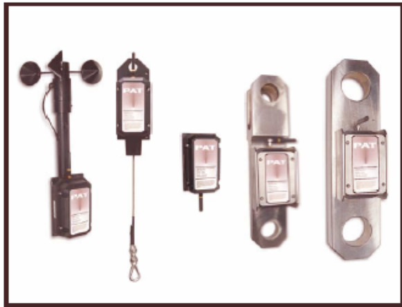
PRS 80 EZ Sensors Options

The three cup wind speed sensor is designed for operation in adverse environments. The quick pivot pedestal mount allows for quick and easy installation in fixed or mobile applications.